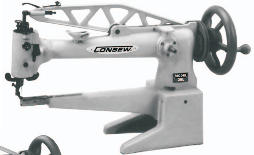
Long Arm Version Model 29L Model 29BL -large bobbin